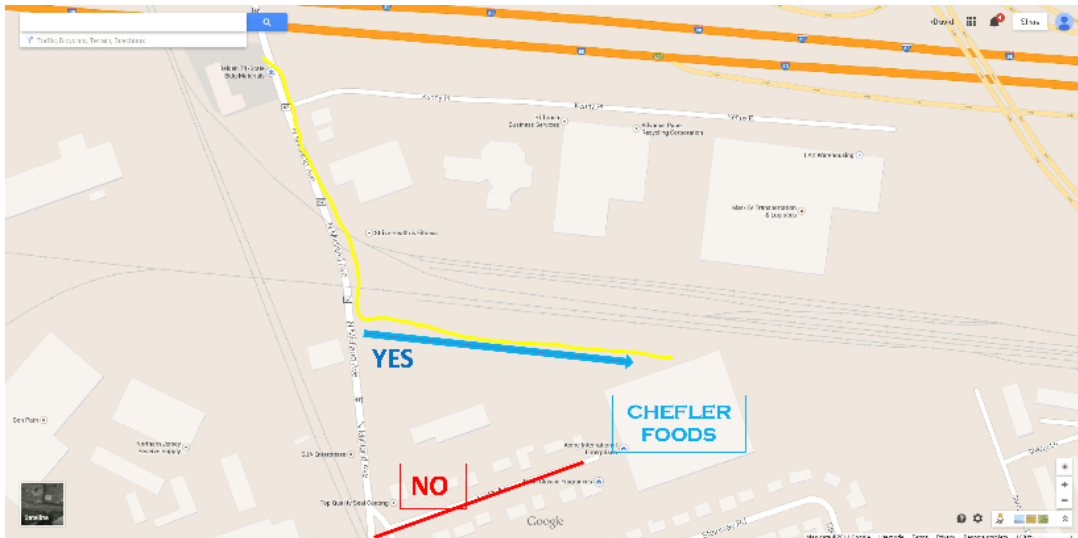
Yellow line is the correct route to take Red line is Lyster Ave...no trucks allowed